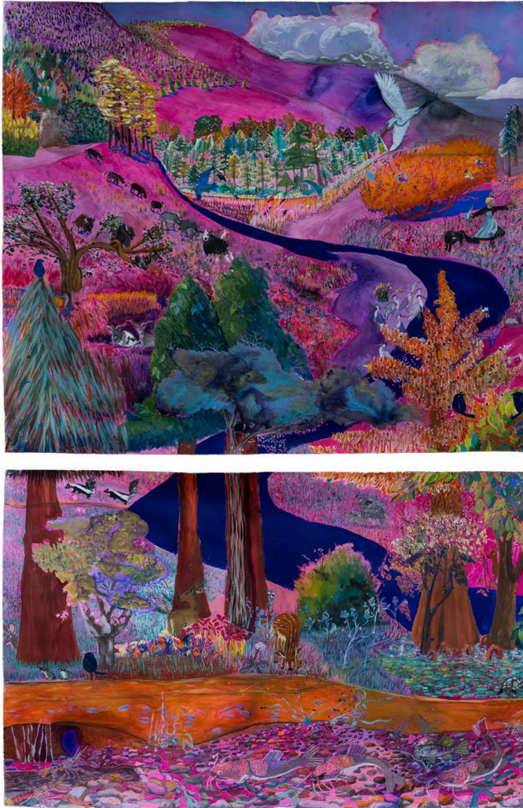
The Hills are Alive , Mixed media on paper diptych, 58.5 x 39.5", 2025. Carroll Swenson-Roberts.