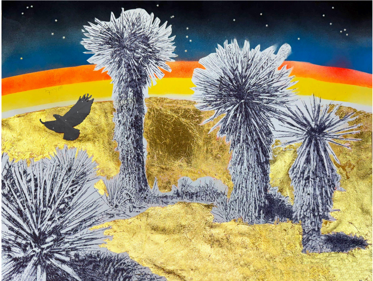
Four Sisters , mixed media, 22 x 30", 2024. Jim Malone.