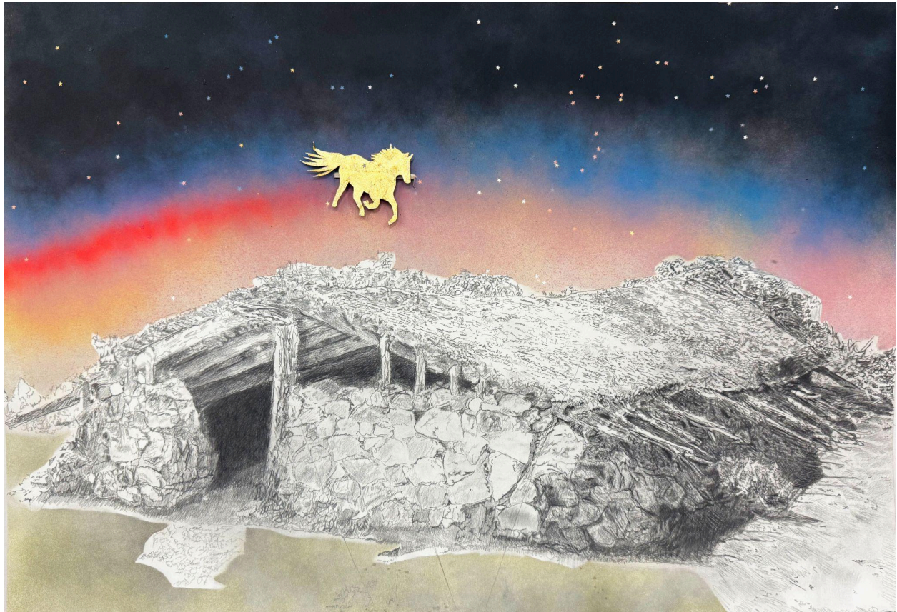
Jachal at Sunset, mixed media, 30 x 44", 2024. Jim Malone.