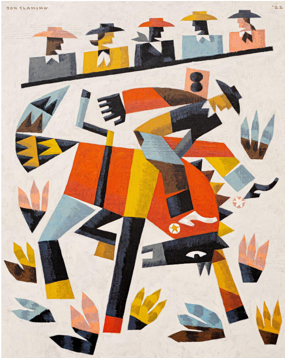
BRONC RIDER , oil on canvas, 60 x 48", 2023.