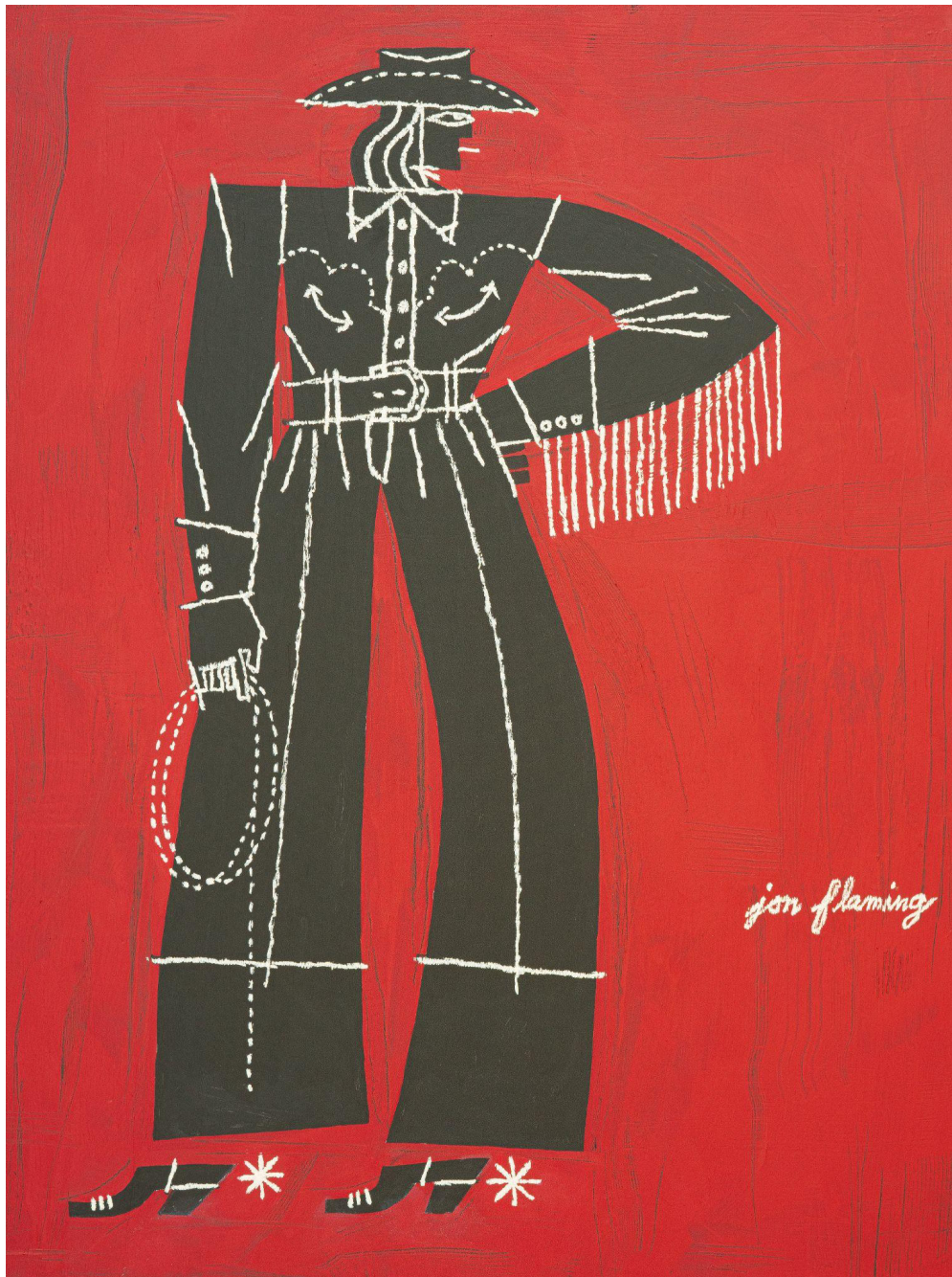
COWGIRL WITH WESTERN FRINGE, acrylic on canvas, 2023, 48 x 36".