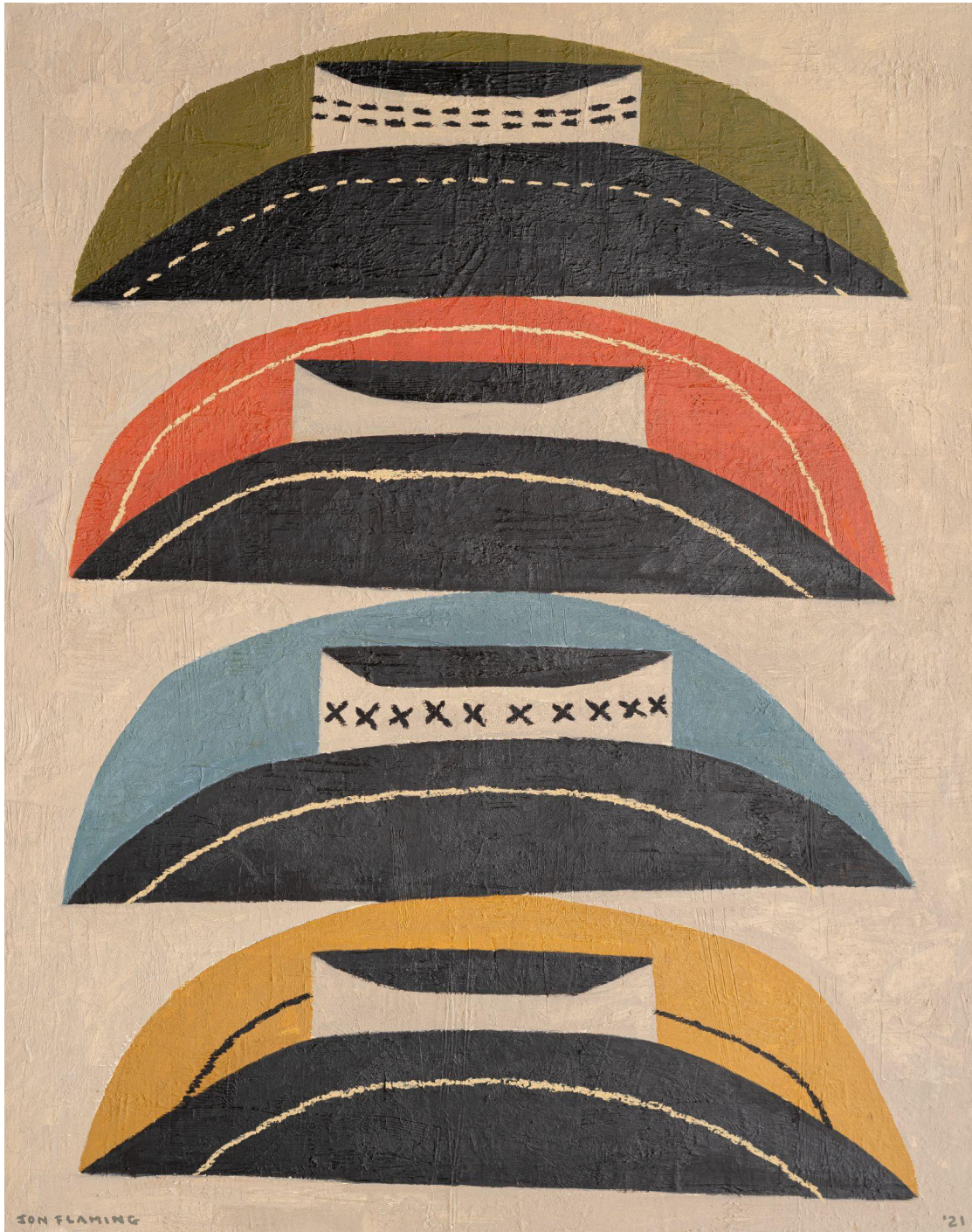
Four Summer Straws , oil on canvas, 60 x 48", 2023.

For Immediate Release 2/14/2024 Contact | Margery Gossett