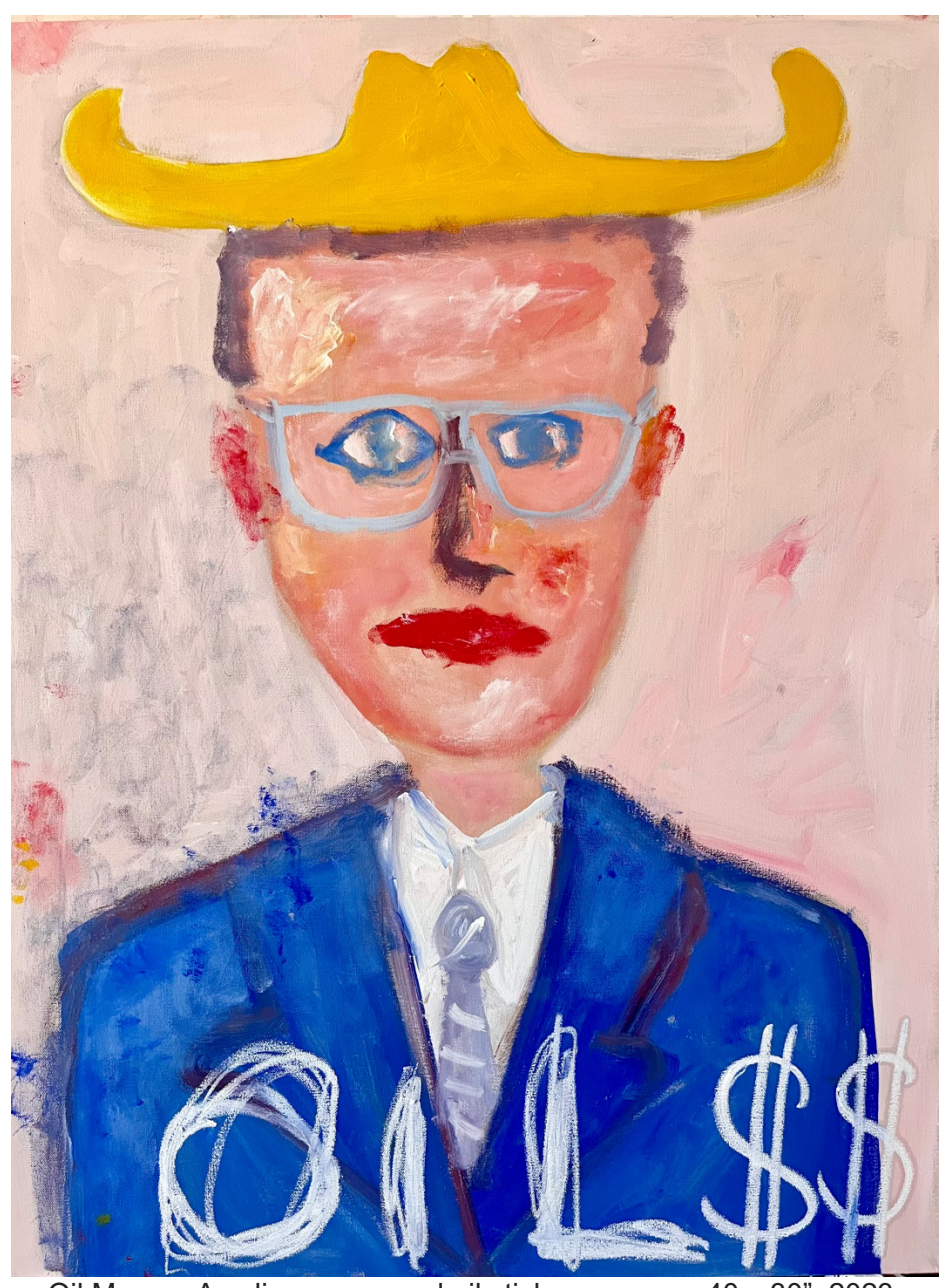
Oil Money, Acrylic, crayon and oil stick on canvas, 40 x 30", 2023.