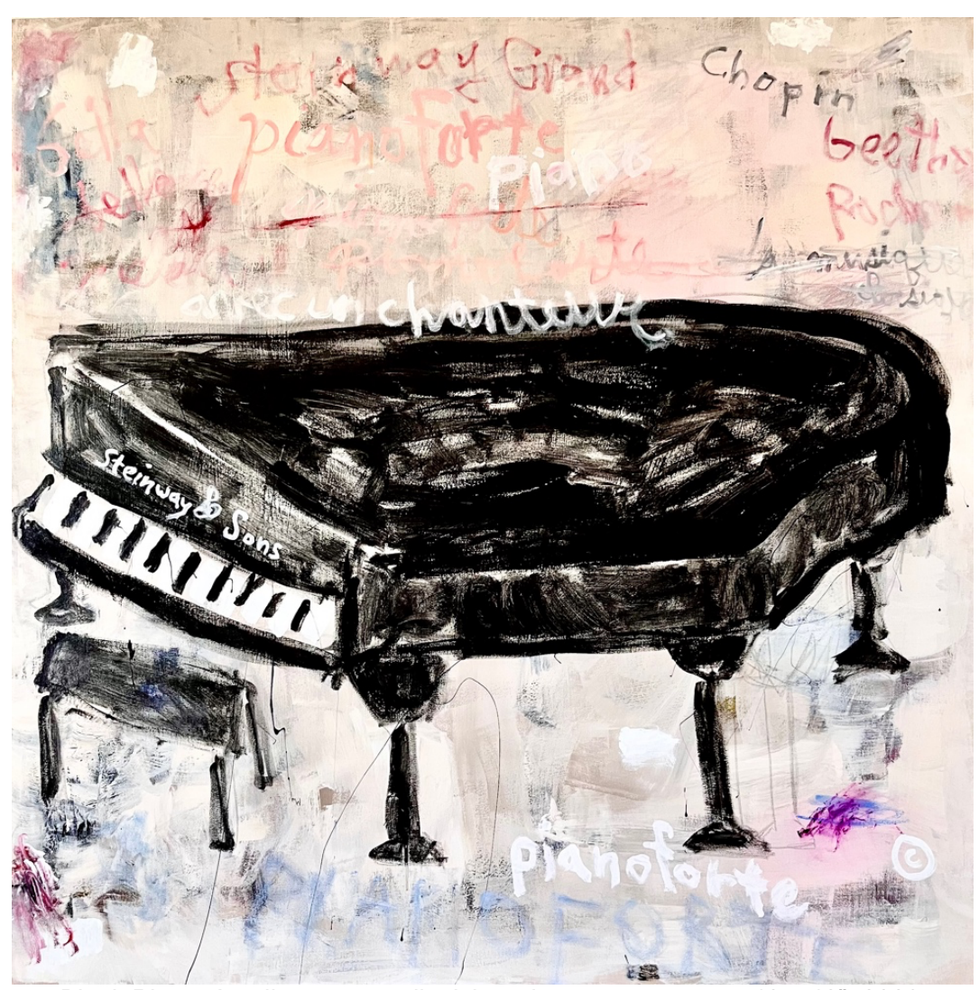
Black Piano, Acrylic, crayon, oil stick and spray on canvas. 48 x 48", 2023.